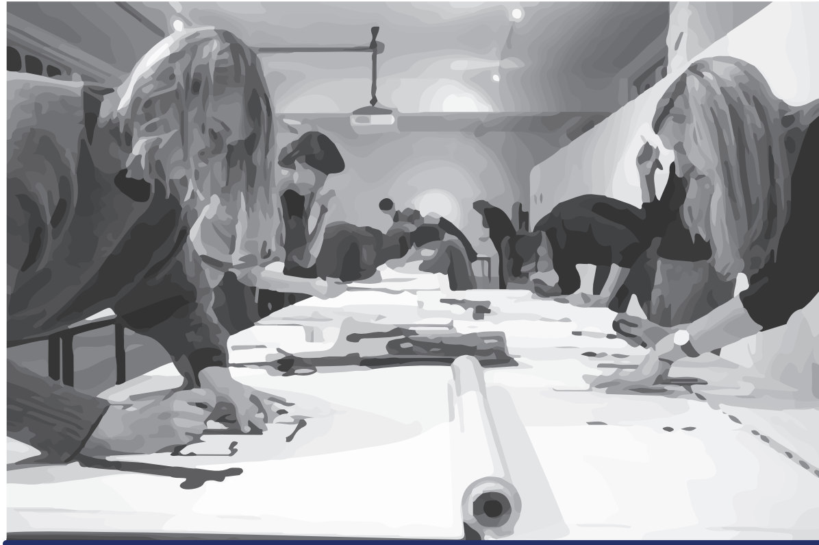
Making a collaborative mural for West Town